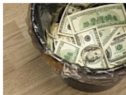
Florida: Here's a little known way to pay off...