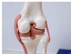
Surprisingly simple solution to help your joints....