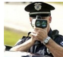
New Rule in Florida: Do N Pay Your Next Car...