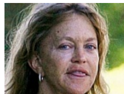
Celebrities Who've Aged the Worst...