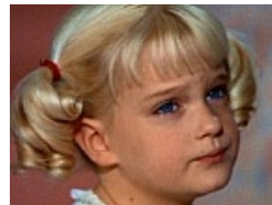
10 TV Little Sisters Who Disappeared From the...