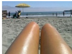
Women have been urged to cease posting these...