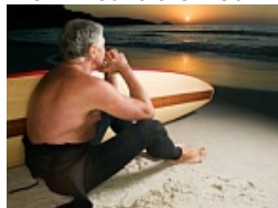
Have a $500K portfolio? Ken Fisher, a 27-year...